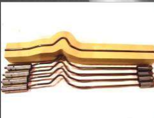
Mandrels with Caps