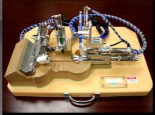
Top Clamp Trimmer with Dotting