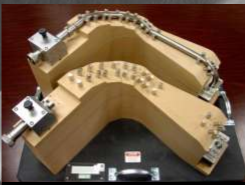
Set Up & Production Check Gage